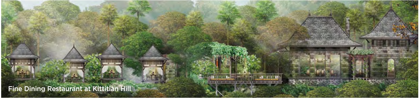
Fine Dining Restaurant at Kittitian Hill

into sophisticated environments” while always refusing to compromise the environment. The architect’s portfolio of properties includes more than 100 distinctive and award-winning conceptions in 26 countries, encompassing such locales as Bangkok, Thailand, Mauritius and Bali.