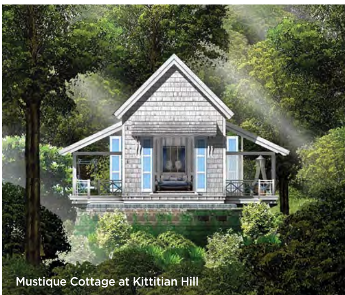
Mustique Cottage at Kittitian Hill

Relish the transcendent aura of the natural elements and marvel at the poetic fusion of light and serenity at Kittitian Hill.