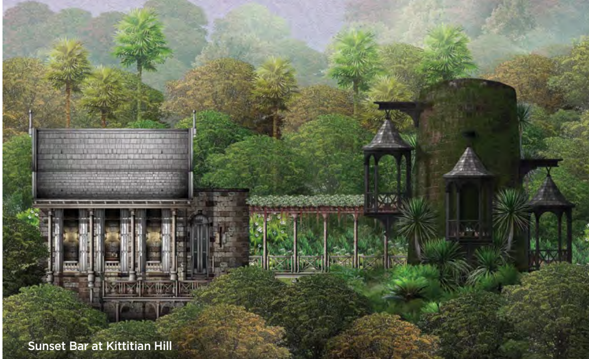
Sunset Bar at Kittitian Hill