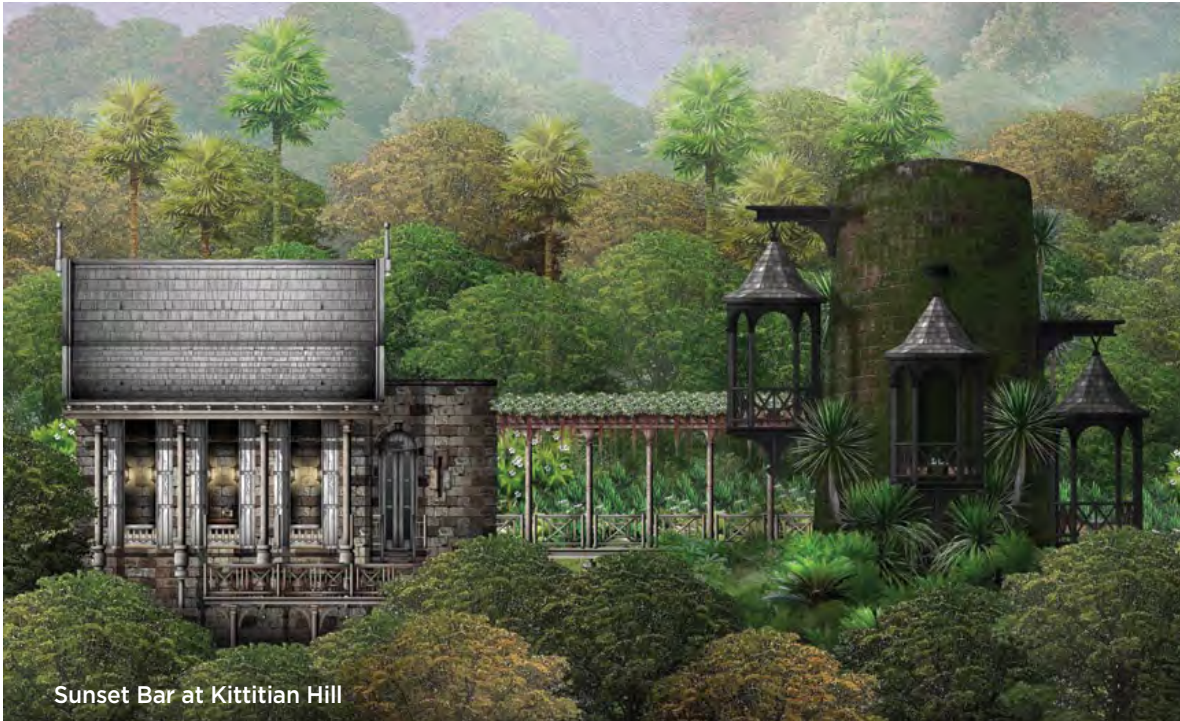
Sunset Bar at Kittitian Hill