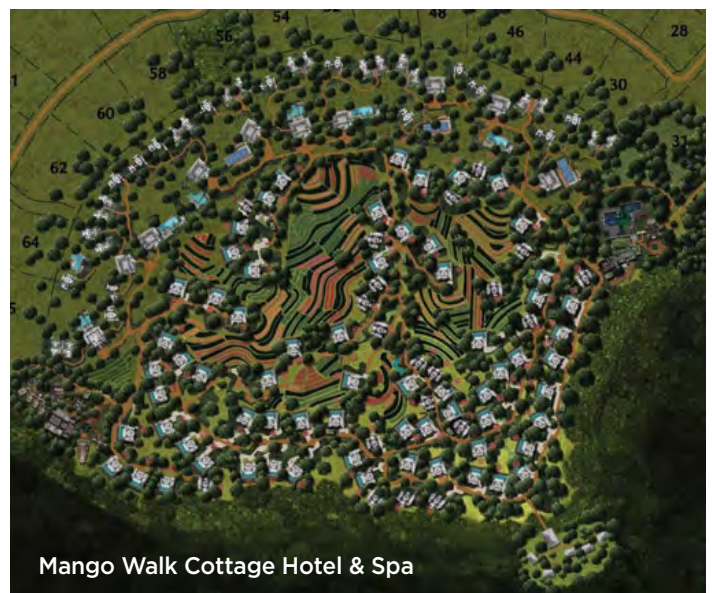
Mango Walk Cottage Hotel & Spa