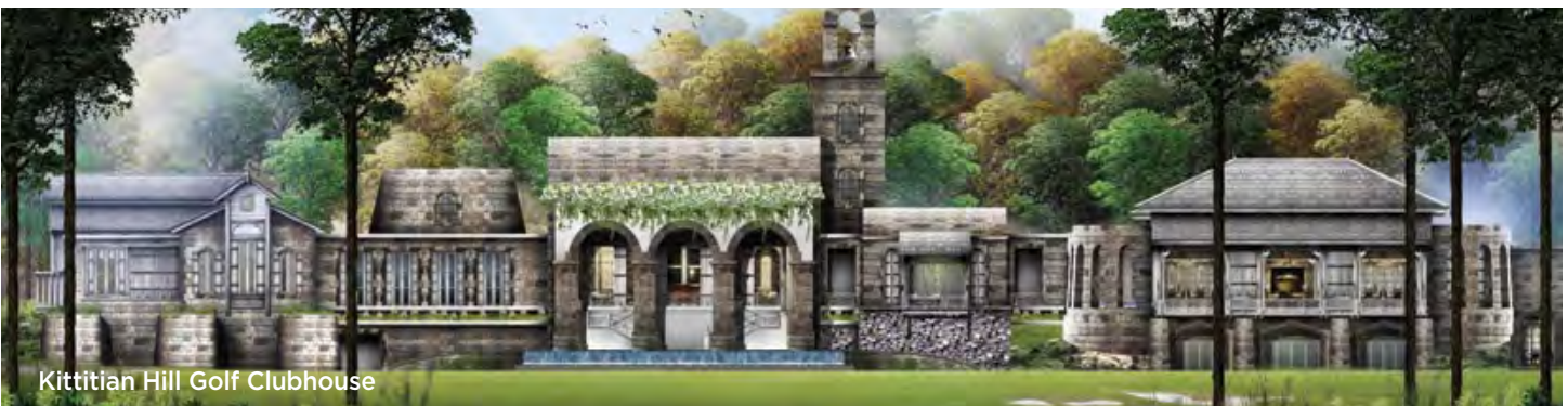
Kittitian Hill Golf Clubhouse