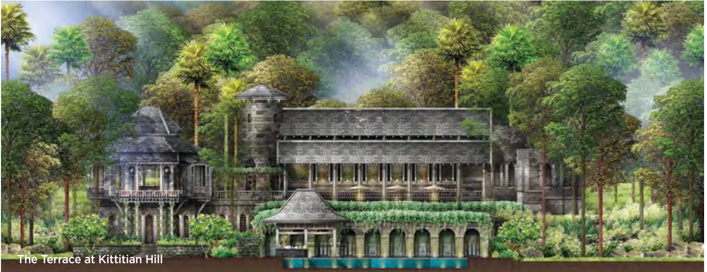
The Terrace at Kittitian Hill

service, signature pools with multi-level decks and outdoor hot tubs, state-of-the-art fitness center, tennis courts, an Ian Woosnam 18-hole championship golf course and clubhouse and access to the Village.