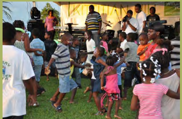
Children from the community of St. Paul's having fun at the Pre-Christmas Family and Fun Day hosted by Kittitian Hill

Finally, with a nod to the imminent holiday season, a commitment was made to host an annual Christmas Party and to ensure that every child receives a gift.