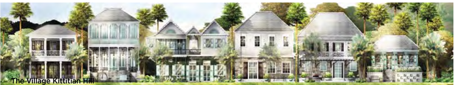
The Village Kittitian Hill

Further to the sales and marketing opportunities available for Kittitian Hill, Preferred Residences will offer owners “high-touch” exchange services and year-round leisure and lifestyle benefits tailored especially for the sophisticated, affluent travelers. These include preferential pricing at participating Preferred Hotel Group affiliated properties worldwide, complimentary Prestige membership in Priority Pass™ airport VIP lounge program, personal concierge services accessible 24/7 online and via phone, and complimentary annual membership in Hertz #1 Club Gold®.